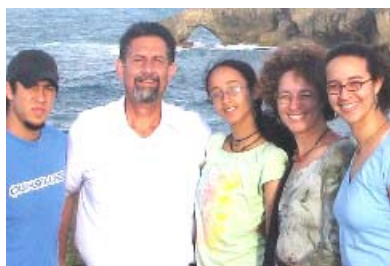
The Mayol Family Southwest Area