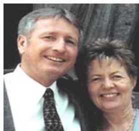
The Shawvers Philadelphia Baptist Association