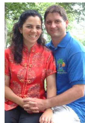
Gutierrez/Schellinger Northwest Area