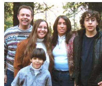
The Gonzalez/Barnes Central Area