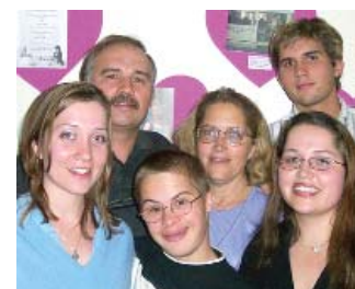
The Long Family Northeast Area